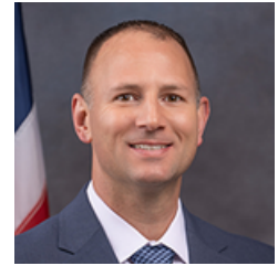
Rep. Chase Tramont