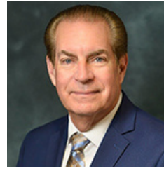
Sen. Tom Wright