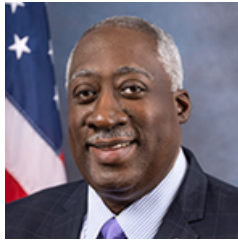
Rep. Webster Barnaby