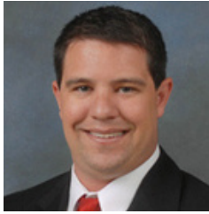
Sen. Travis Hutson